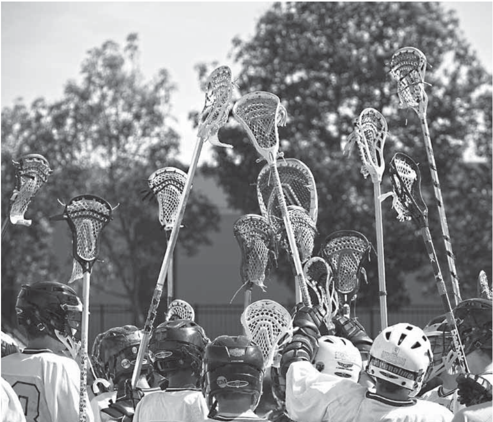
Eagles Varsity boys lacrosse break it down pregame.